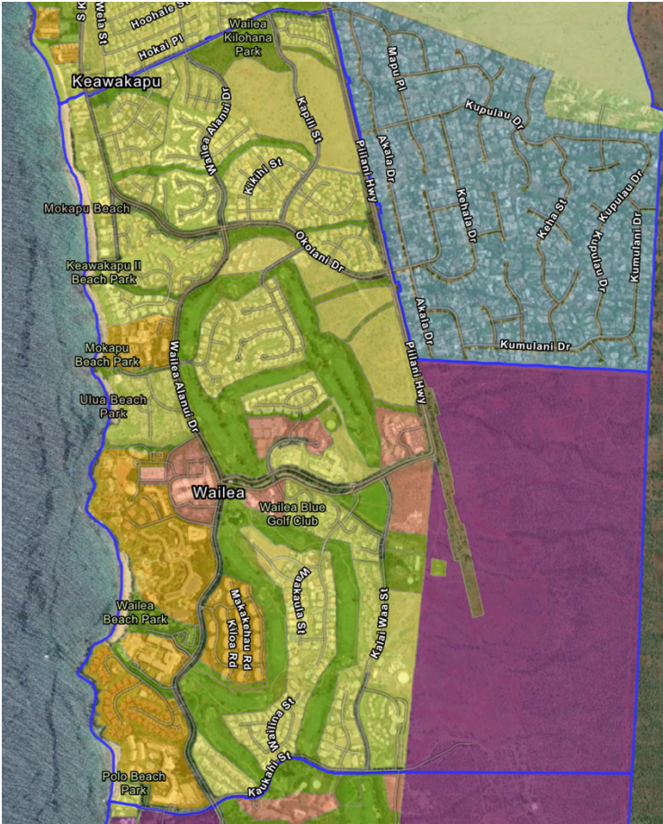
1998 Kīhei-Mākena Community Plan